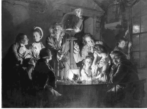
46 ,1768 JOSEPH WRIGHT OF derby